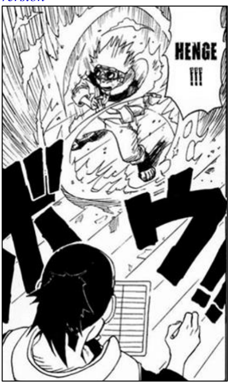
Figure 4: use of speech balloons in scanlated version <sup>6</sup>

On the other hand, in some instances in the scanlations, though less than the translations, the scanlators have used top to down lettering, especially when the space permits it. (see Figure 5)