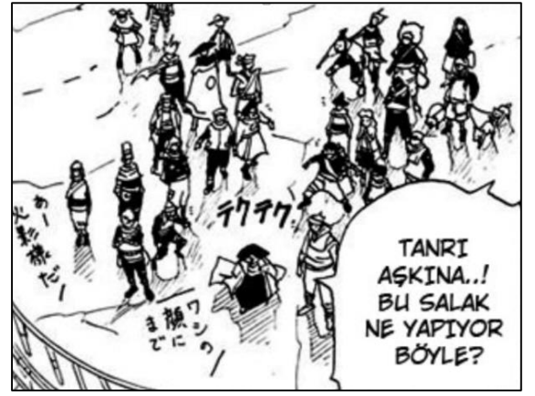
Figure 8: Translated dialogue of same panel as scanlated Figure 8 in translated version<sup>10</sup>

Figure 7: Untranslated dialogue in picture in scanlated version<sup>9</sup>