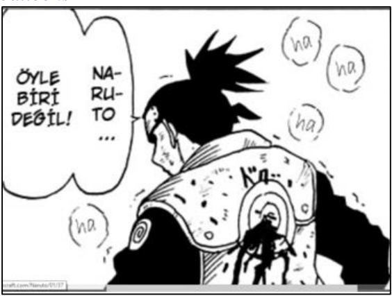
Figure 2: use of hyphening for lack of space in balloons^4

In both the translation and scanlation the speech balloons and the difficulty of fitting Turkish words into the balloons are identical, but the way in which speech is arranged in the balloons differs in the translated and scanlated versions.